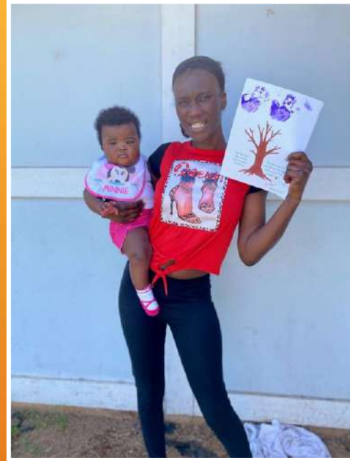
First "Mother's Day" greeting card made by mother and daughter - 😊😊