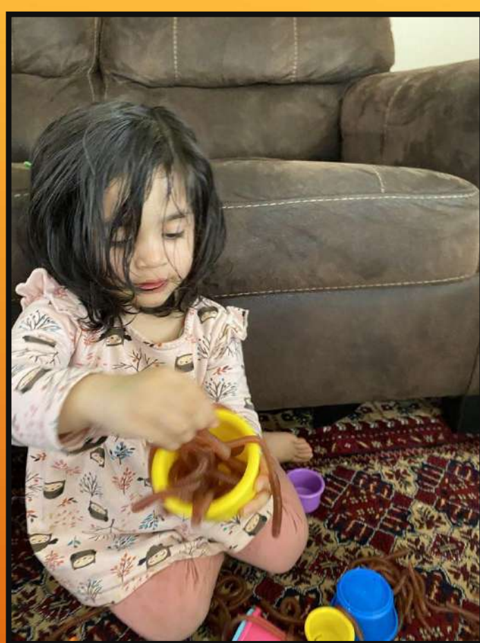
Plastic fishing worms with stacking cups

“Experimenting with sensory materials stimulates expressive language for children with speech delays.”