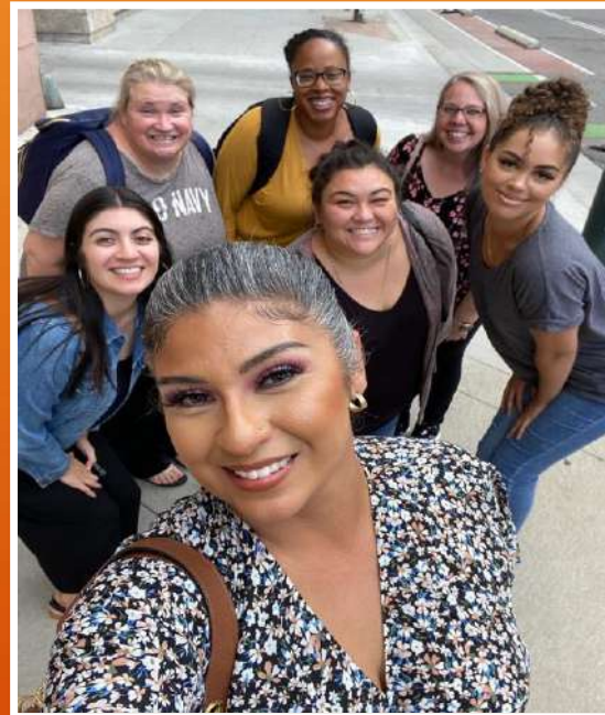
EHS at the County Fair