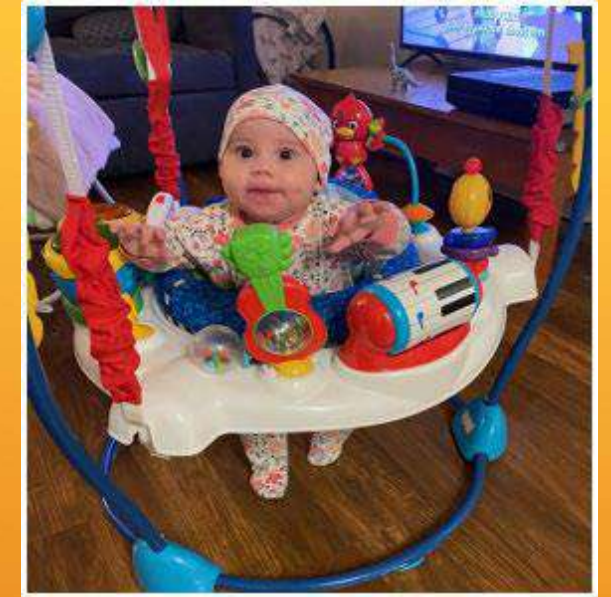
"So much to see"