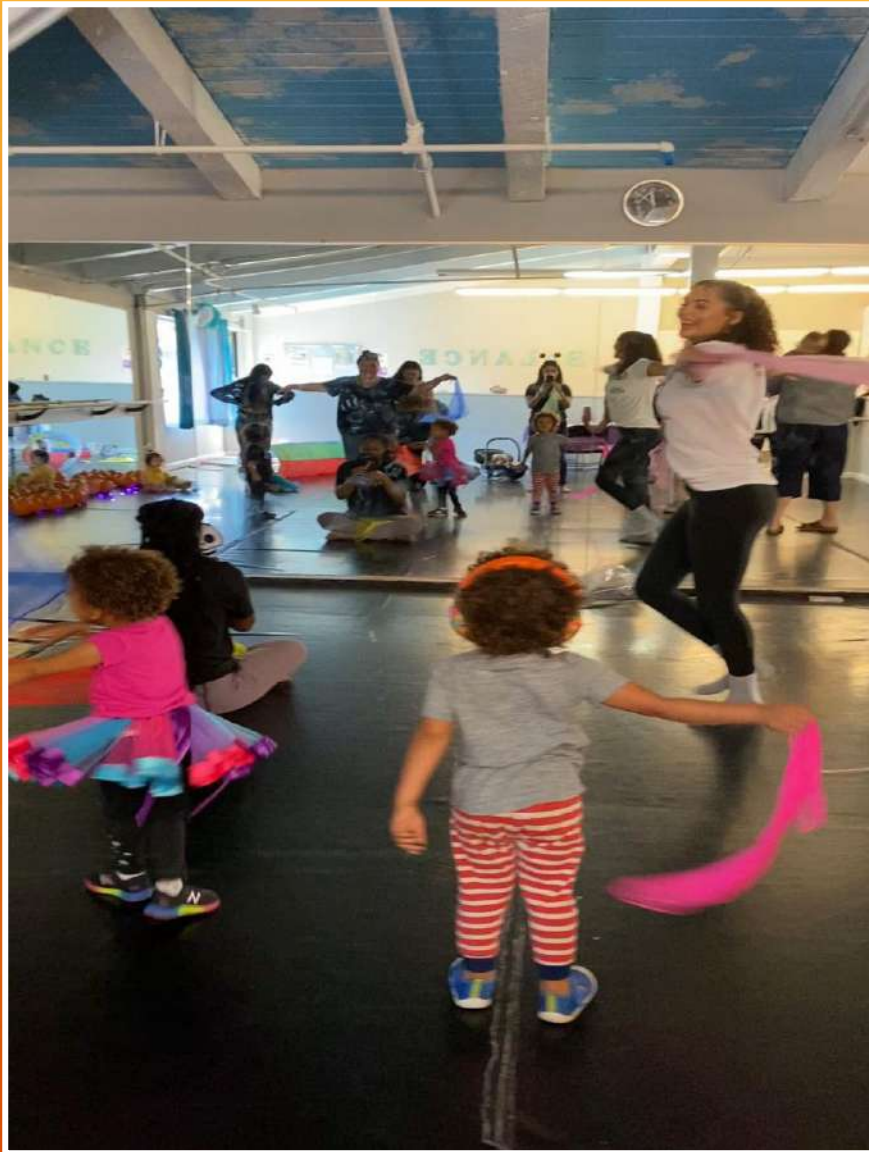
Music & Movement Socialization