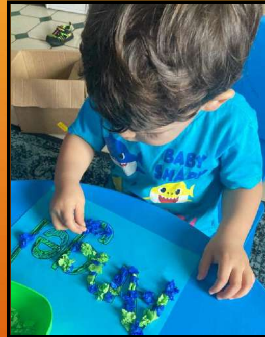
30 month-old Angel learning name identification while practicing fine motor skills and learning colors