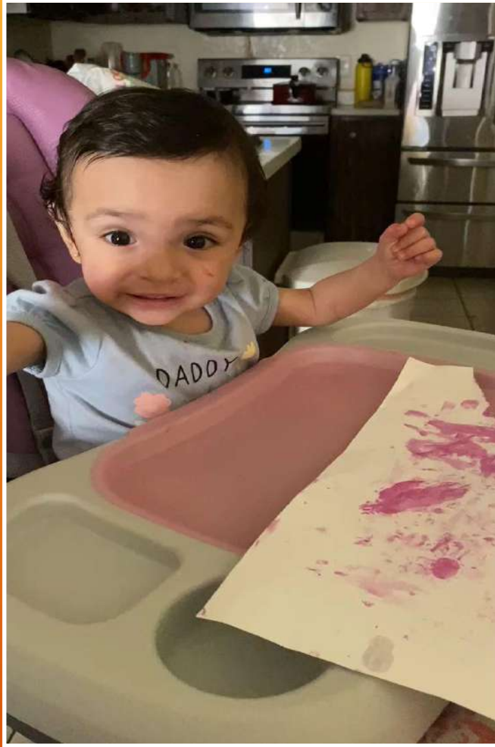
"Where is Camila?"