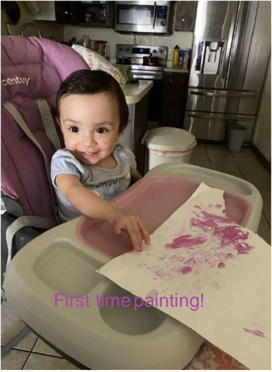
First time painting!